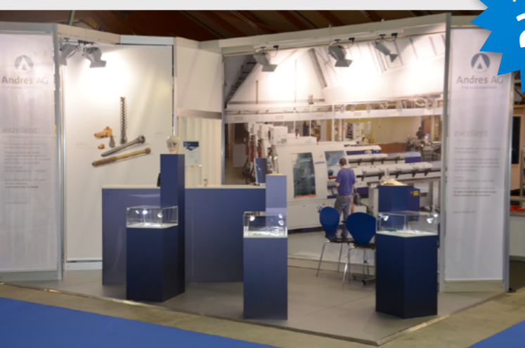
Andres AG with its new exhibition stand at World Medtech Forum Lucerne