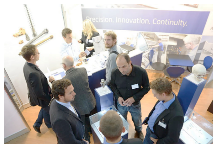
We welcomed lots of visitors at our stand at the 2nd World Medtech Forum in Lucerne, where we enjoyed many interesting discussions.